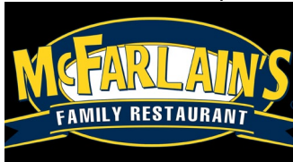
McFarlain's at the Imax Complex