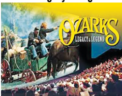
Ozarks Legacy & Legend