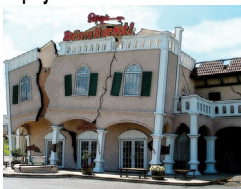
Ripley's Believe-It-Or-Not Museum