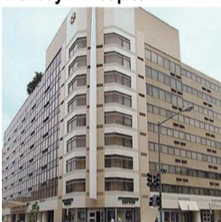
Holiday Inn Capitol