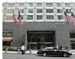
Parker New York